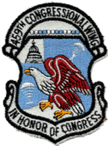
459 Military Airlift Wing emblem

459 Troop Carrier Wing, Medium emblem, On a shield azure an American eagle proper flying over clouds in the base argent between two parachutes, one in chief transporting an airman, one in base transporting supplies all of the last; In chief a canton argent charged with the Capitol dome of the second. SIGNIFICANCE: The eagle, flying above the clouds in a blue sky, relates to the Air Force mission. The two parachutes with supplies and airman signify the troop carrier mission. The canton, in the dexter chief, of the shield, is an heraldic symbol. It symbolizes an honorable addition to the significance of the emblem. The canton is charged with the Capitol dome and implies this unit is called the "Congressional Wing", and the motto is "In Honor of Congress." (Approved, 1956)